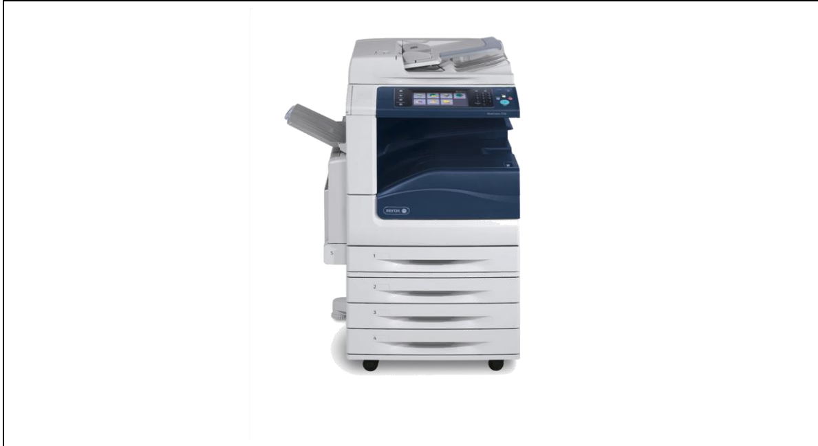
Figure 1: Xerox® WorkCentre® 7970/7970i 2016 Xerox® ConnectKey® Technology

The TOE can integrate with an IPv4 network with native support for DHCP. The hardware included in the TOE is shown in the figure below.