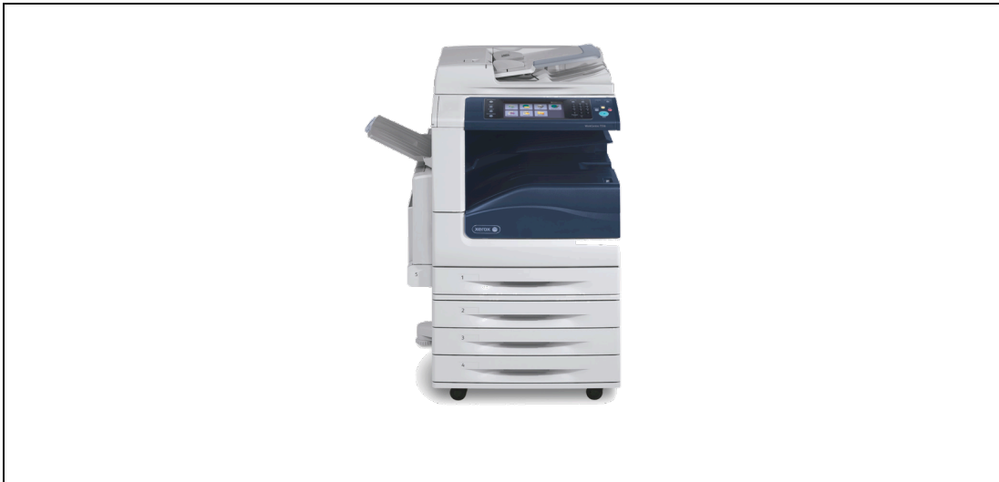
Figure 3: Xerox WorkCentre 7830/7835/7845/7855