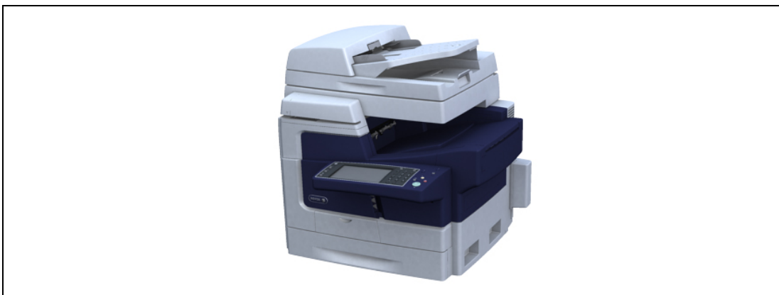
Figure 4: Xerox ColorQube 8700/8900 ConnectKey 1.5 Technology