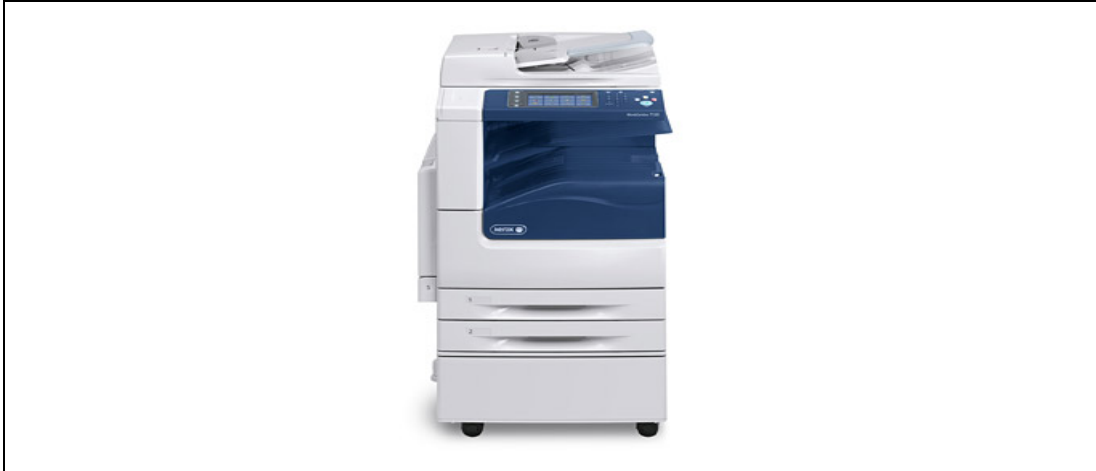
Figure 2: Xerox WorkCentre 7220/7225