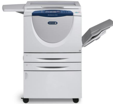
Figure 2: Xerox WorkCentre™ 5735/5740/5745/5755/5765/5775/5790

The various software and firmware that comprise the TOE are listed in Table 2. A system administrator can ensure that they have a TOE by printing a configuration sheet and comparing the version numbers reported on the sheet to the table below.