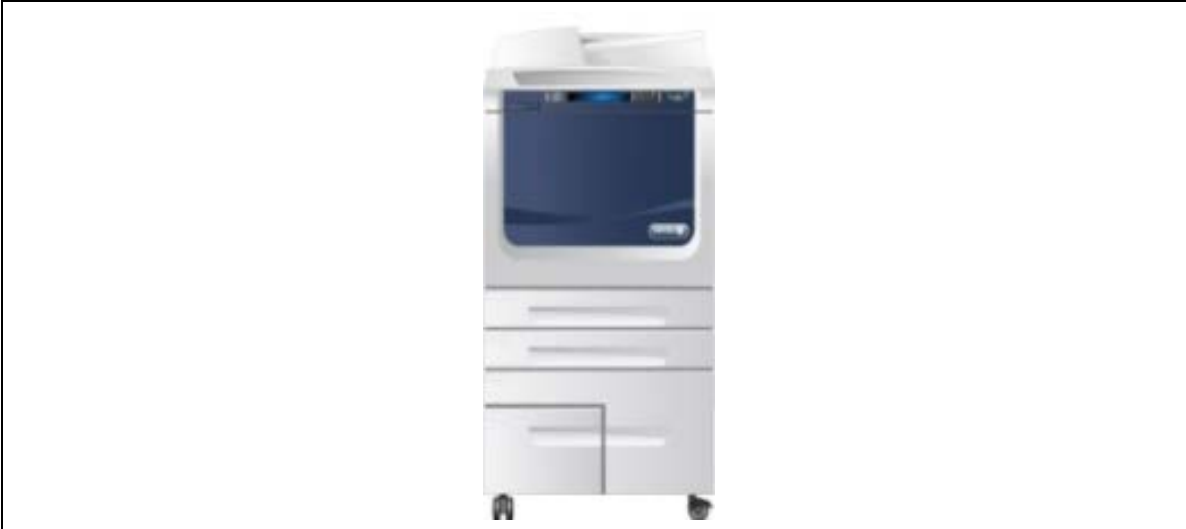
Figure 1: WorkCentre® 5845/5855/5865/5875/5890 Xerox® ConnectKey® Technology with SIPRNet Support

The TOE can integrate with an IPv4 network with native support for DHCP. The hardware included in the TOE is shown in the figure below.