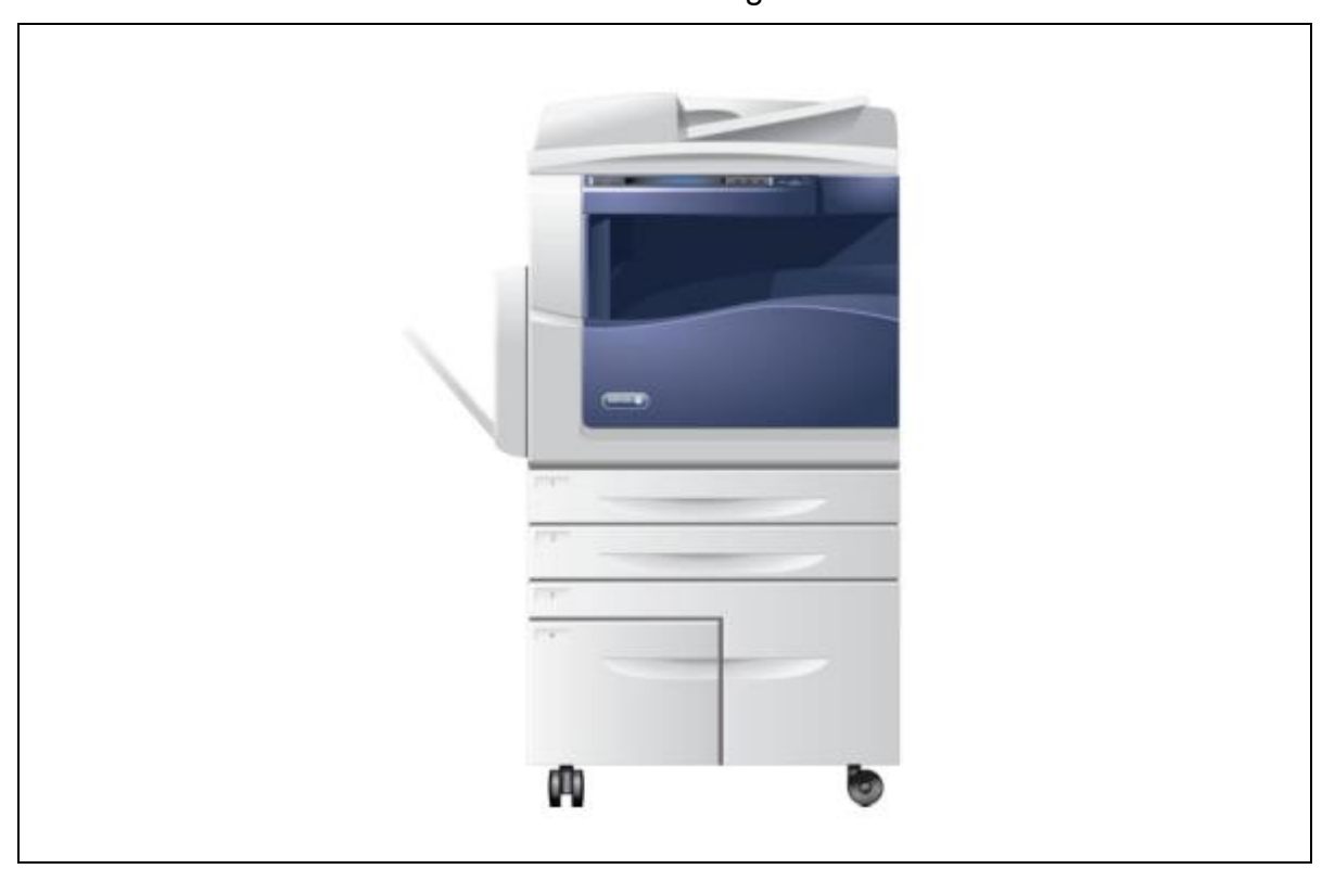
Figure 1: Xerox® WorkCentre® 5945/5945i/5955/5955i 2016 Xerox® ConnectKey® Technology

The TOE can integrate with an IPv4 network with native support for DHCP. The hardware included in the TOE is shown in the figure below.