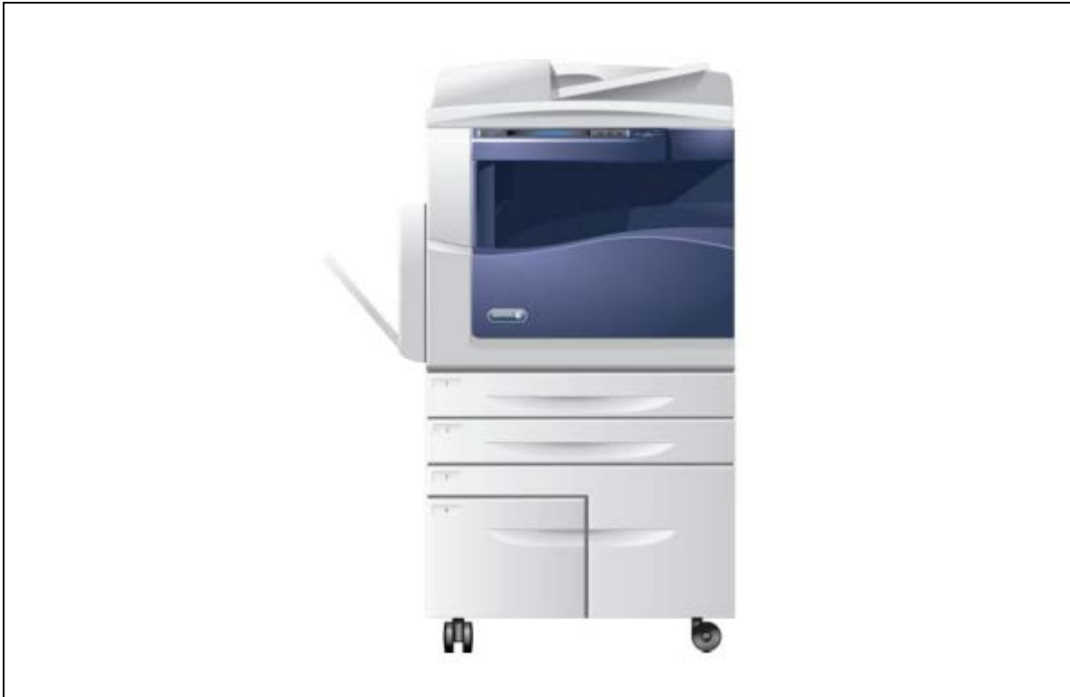
Figure 1: WorkCentre® 5945/5955 Xerox® ConnectKey® Technology with SIPRNet Support

The TOE can integrate with an IPv4 network with native support for DHCP. The hardware included in the TOE is shown in the figure below.