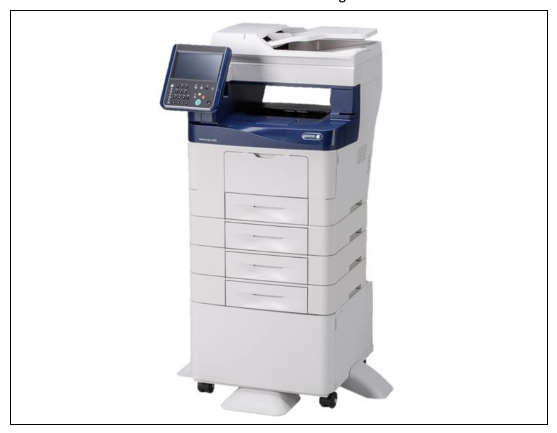
Figure 1: Xerox® WorkCentre® 6655/6655i 2016 Xerox® ConnectKey® Technology

The TOE can integrate with an IPv4 network with native support for DHCP. The hardware included in the TOE is shown in the figure below.