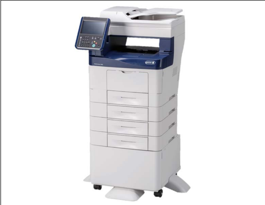
Figure 1: WorkCentre® 6655 Xerox® ConnectKey® Technology with SIPRNet Support

The TOE can integrate with an IPv4 network with native support for DHCP. The hardware included in the TOE is shown in the figure below.