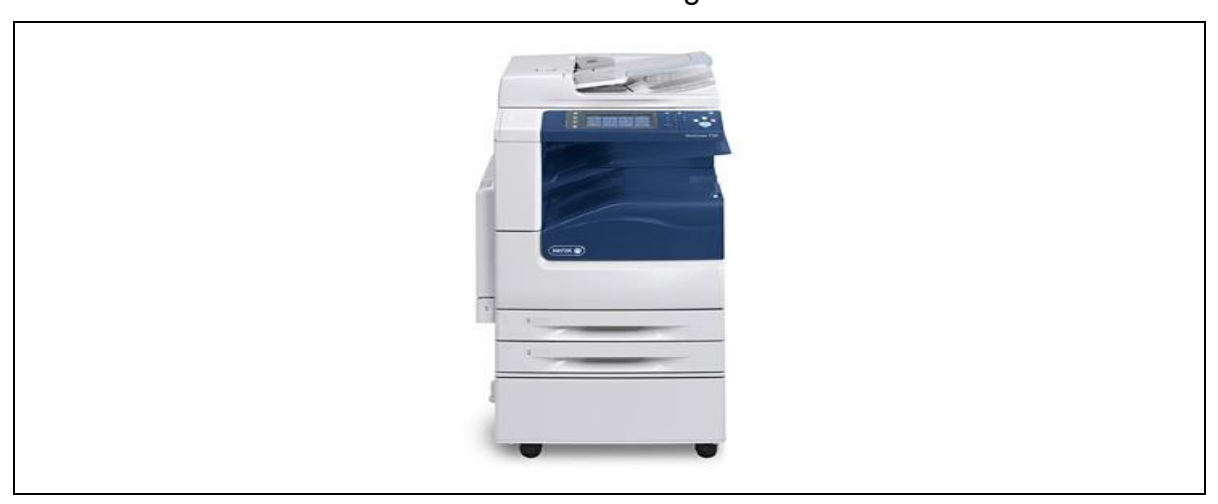
Figure 1: Xerox® WorkCentre® 7220/7220i/7225i 2016 Xerox® ConnectKey® Technology

The TOE can integrate with an IPv4 network with native support for DHCP. The hardware included in the TOE is shown in the figure below.