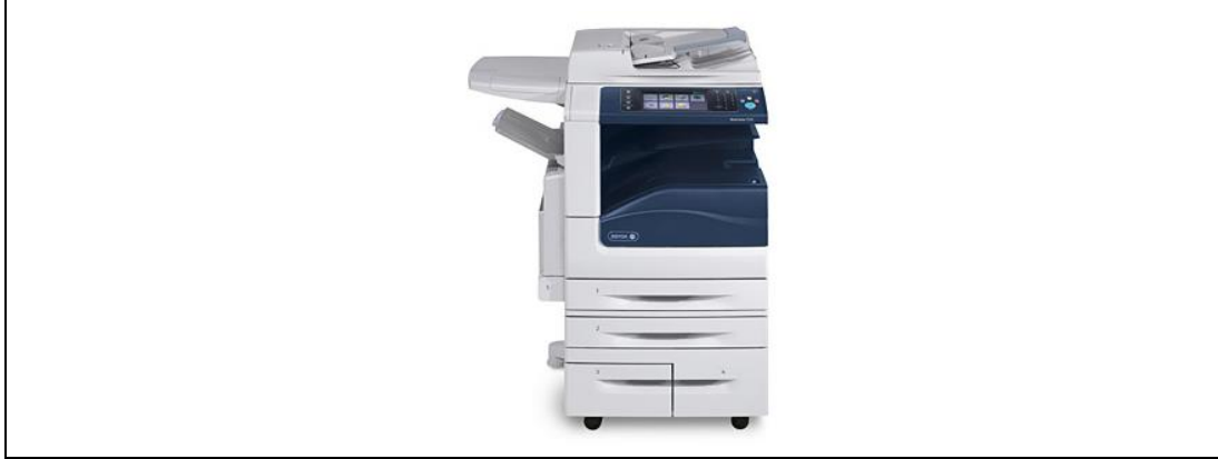
Figure 1: Xerox WorkCentre 7535/7556

The TOE can integrate with an IPv4 network with native support for DHCP. The hardware included in the TOE is shown in the following figures.