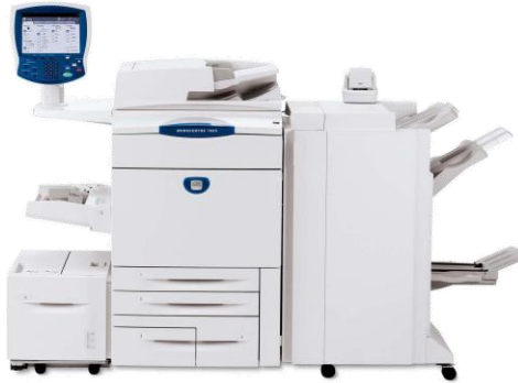
Figure 2: Xerox WorkCentre™ 7755/7765/7775

The various software and firmware that comprise the TOE are listed in Table 2. A system administrator can ensure that they have a TOE by printing a configuration sheet and comparing the version numbers reported on the sheet to the table below.