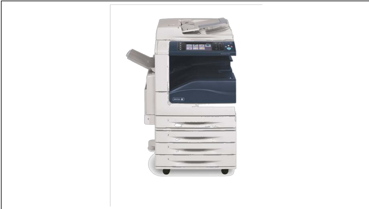
Figure 1: WorkCentre® 7830/7835 Xerox® ConnectKey® Technology with SIPRNet Support

The TOE can integrate with an IPv4 network with native support for DHCP. The hardware included in the TOE is shown in the figure below.