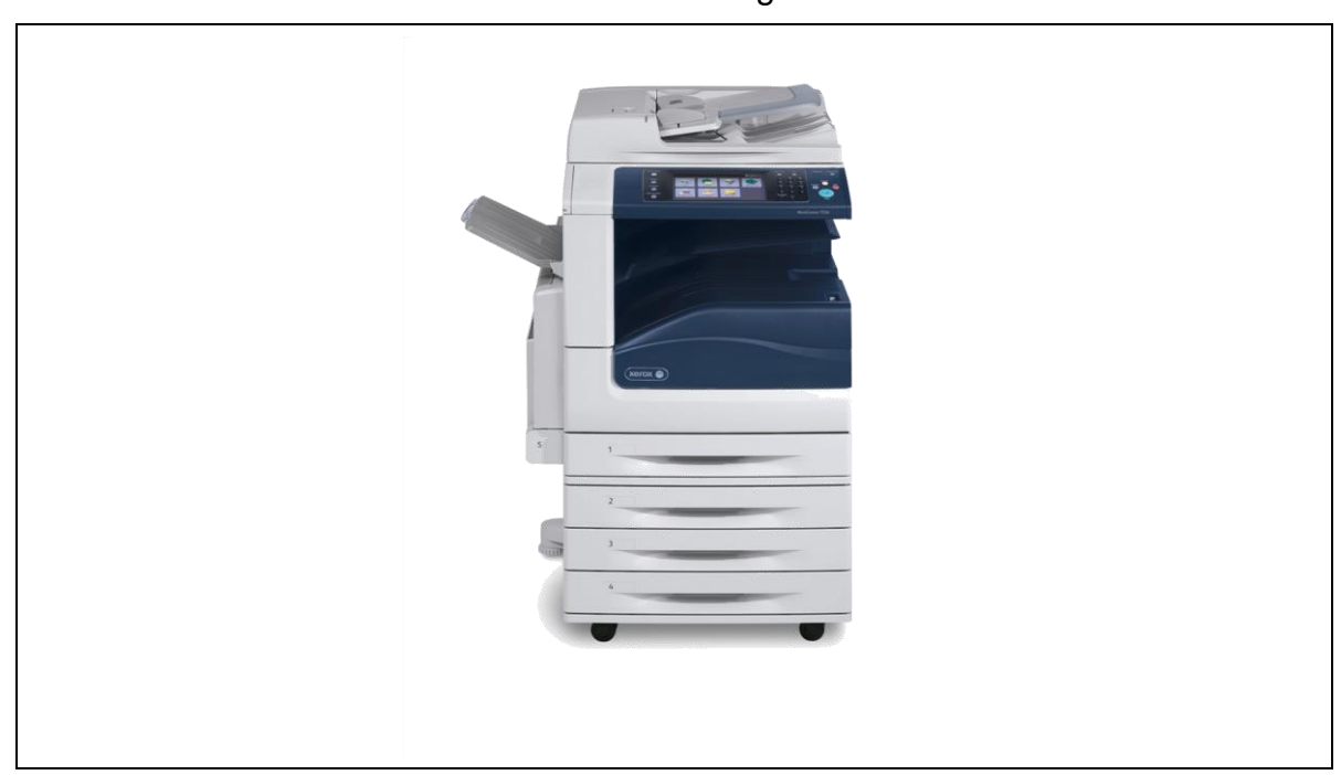
Figure 1: Xerox® WorkCentre® 7845/7845i/7855/7855i 2016 Xerox® ConnectKey® Technology

The TOE can integrate with an IPv4 network with native support for DHCP. The hardware included in the TOE is shown in the figure below.