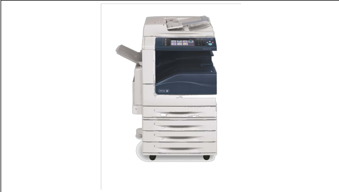
Figure 1: Xerox® WorkCentre® 7830/7830i/7835/7835i/EC7836 2016 Xerox® ConnectKey® Technology

The TOE can integrate with an IPv4 network with native support for DHCP. The hardware included in the TOE is shown in the figure below.