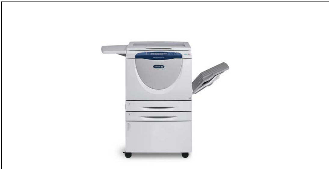
Figure 1: Xerox WorkCentre 5755

The TOE can integrate with an IPv4 network with native support for DHCP. The hardware included in the TOE is shown in the figure below.